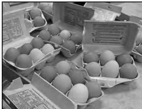
Donated eggs that we handed out to Soup Kitchen guests.