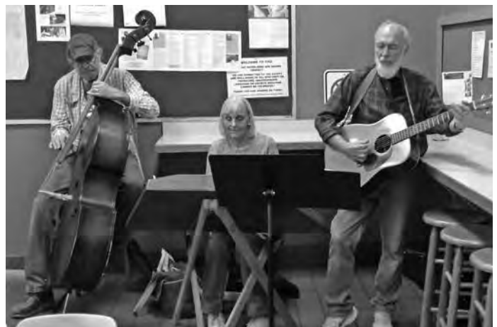
Easter entertainers at The Soup Kitchen.