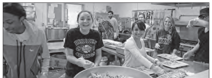
Berrien Springs High School Honor Society working at the Soup Kitchen.