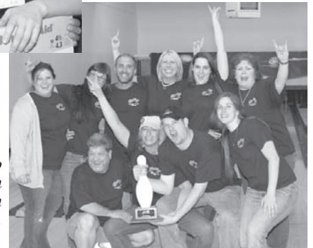
Clementine's Too reclaimed the Team Spirit trophy for the fifth time in six years.